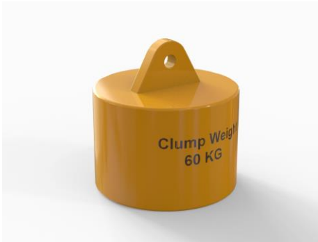
Clump Weight 60 Kg