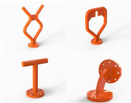
ROV Handles and Adapters