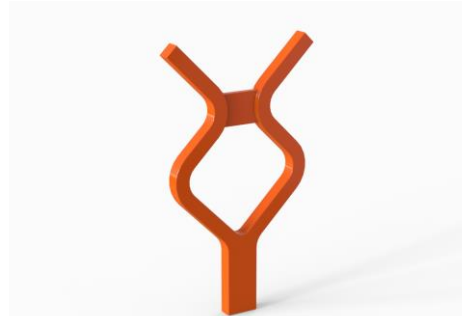
Custom ROV Interface